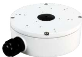
A22 JUNCTION BOX