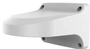
A29 A29 WALL MOUNT