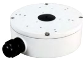
A22 JUNCTION BOX